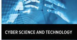
CYBER SCIENCE AND TECHNOLOGY