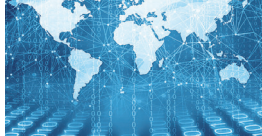
PROCESSING AND EXPLOITATION