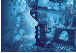
CONNECTIVITY AND DISSEMINATION